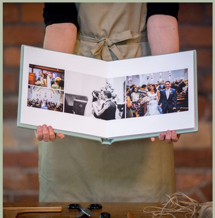
Handmade 10x10" 15 double page spread Fine Art Album (starts at £320)