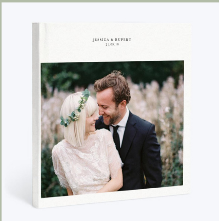
10x10" Hardback photo album (starts at £60)